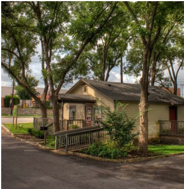
Phase 1.0 - Building IV